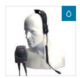
CXR5/DT9* Bone conductive skull mic with heavy duty PTT