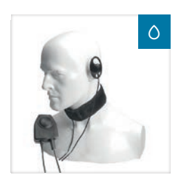
CXR16/DT9* Throat mic / earpiece with heavy duty PTT