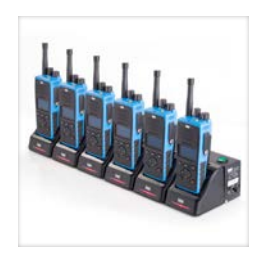
CSBHT Intelligent six-pod rapid charger

Supplied package includes: Li-ion battery pack, drop-in charger, belt clip, high-efficiency antenna and quick-start user guide.