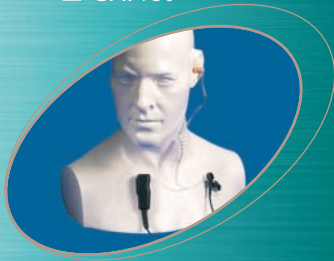
■ EA15/750 ▲ EA15/950