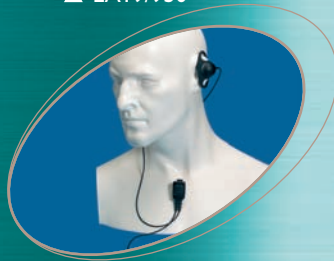
■ EA12/750 ▲ EA12/950